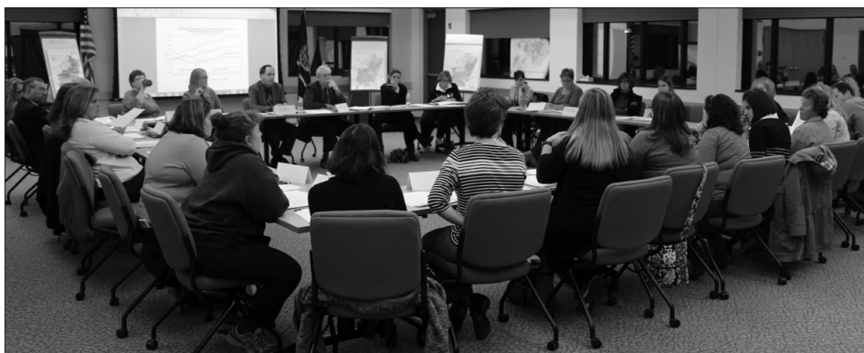
Many parents volunteer each fall to represent their child's school on the Instructional Space Committee. It's one of the many ways parents and residents can become more involved.

group in terms of age, ethnicity, and life experiences. From teens to senior citizens, each brings a unique perspective to students, and possesses an ability to share real-world experiences that help make classroom learning more relevant to a child. Whether you are an interested parent, business owner, or district resident, we have the perfect opportunity for you! To learn more, visit www.rhnet.org/volunteer .